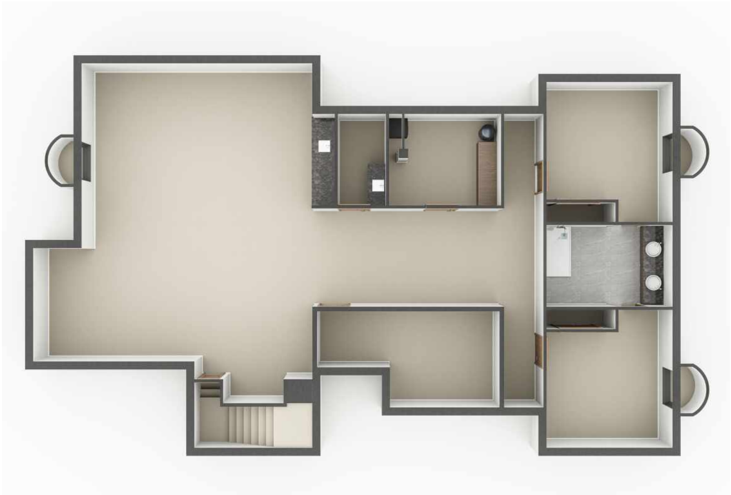
BASEMENT | VIEW 2