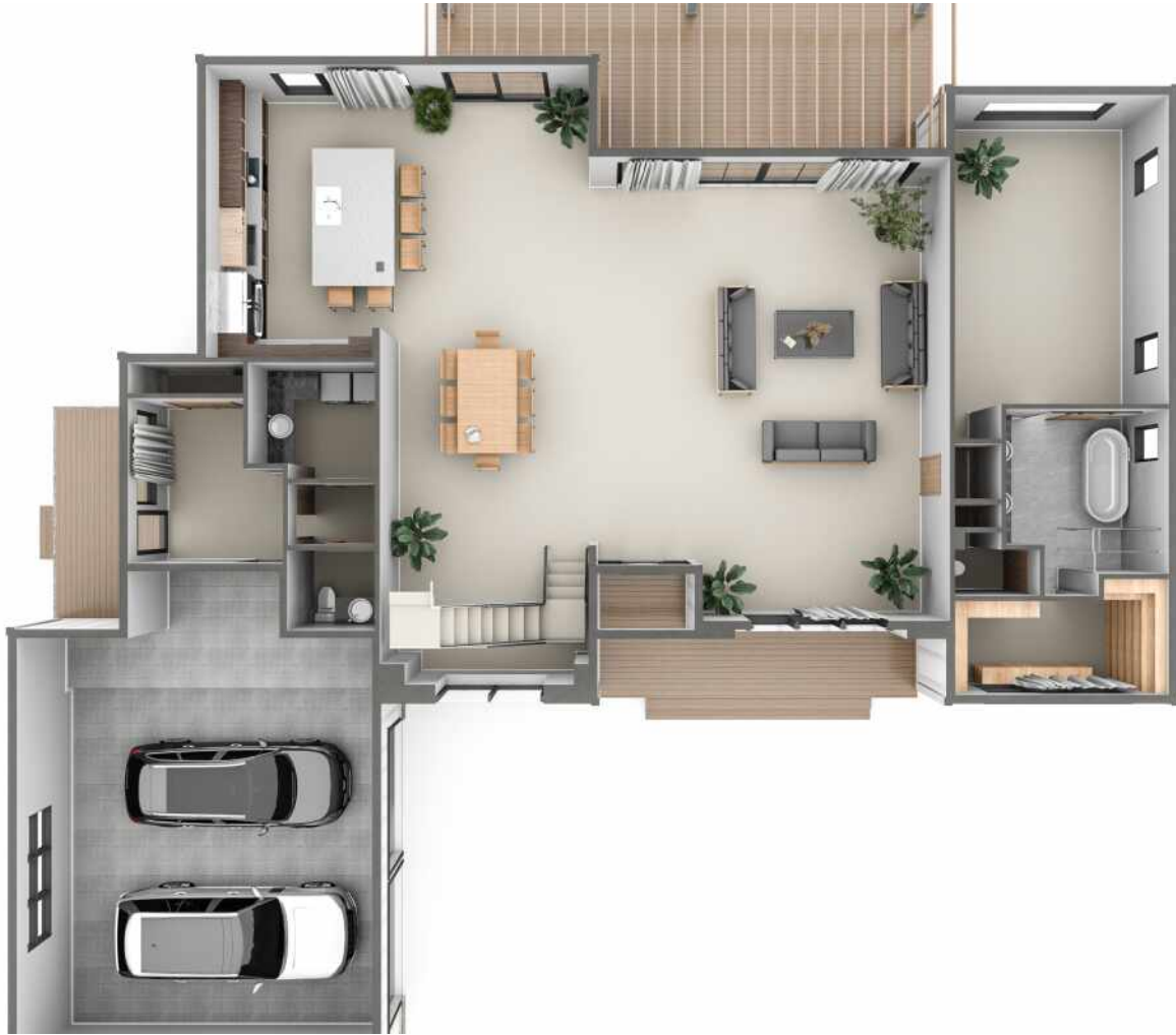
FIRST FLOOR | VIEW 2