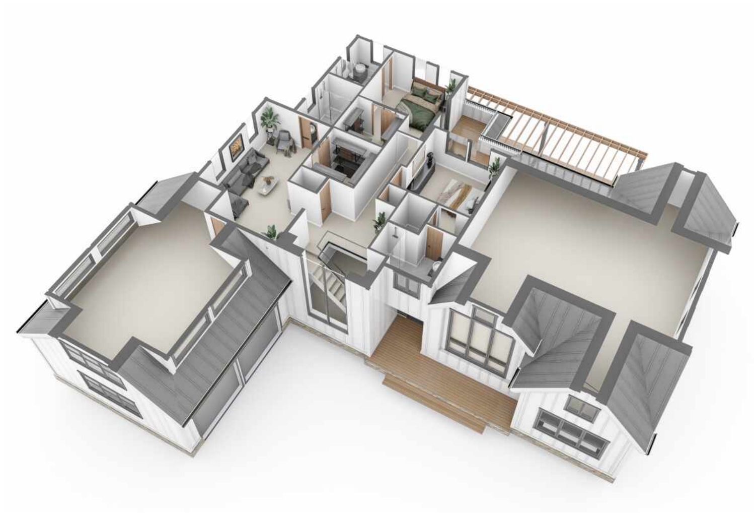
SECOND FLOOR | VIEW 1