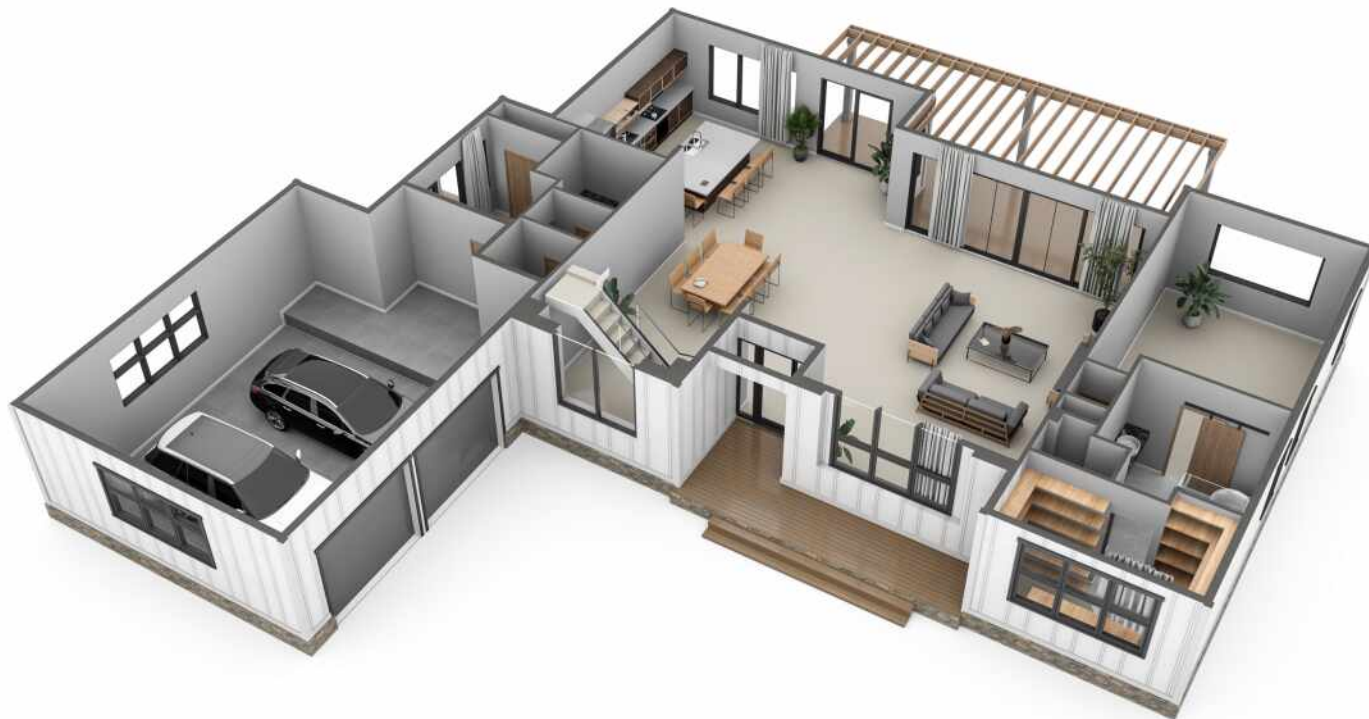
FIRST FLOOR | VIEW 1