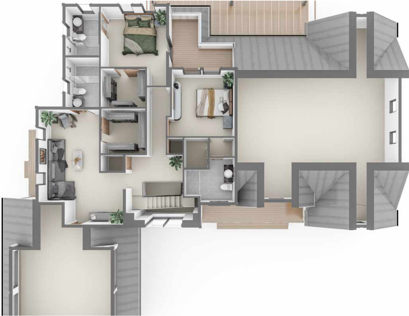
SECOND FLOOR | VIEW 2