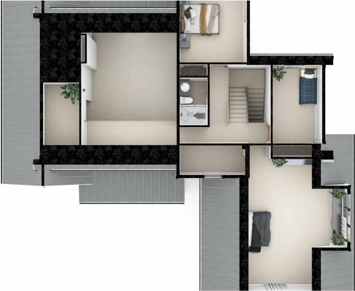
SECOND FLOOR | VIEW 2