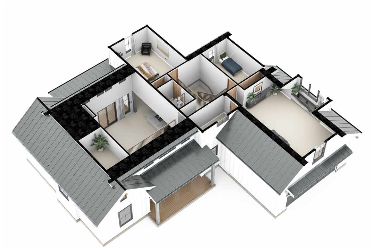
SECOND FLOOR | VIEW 1