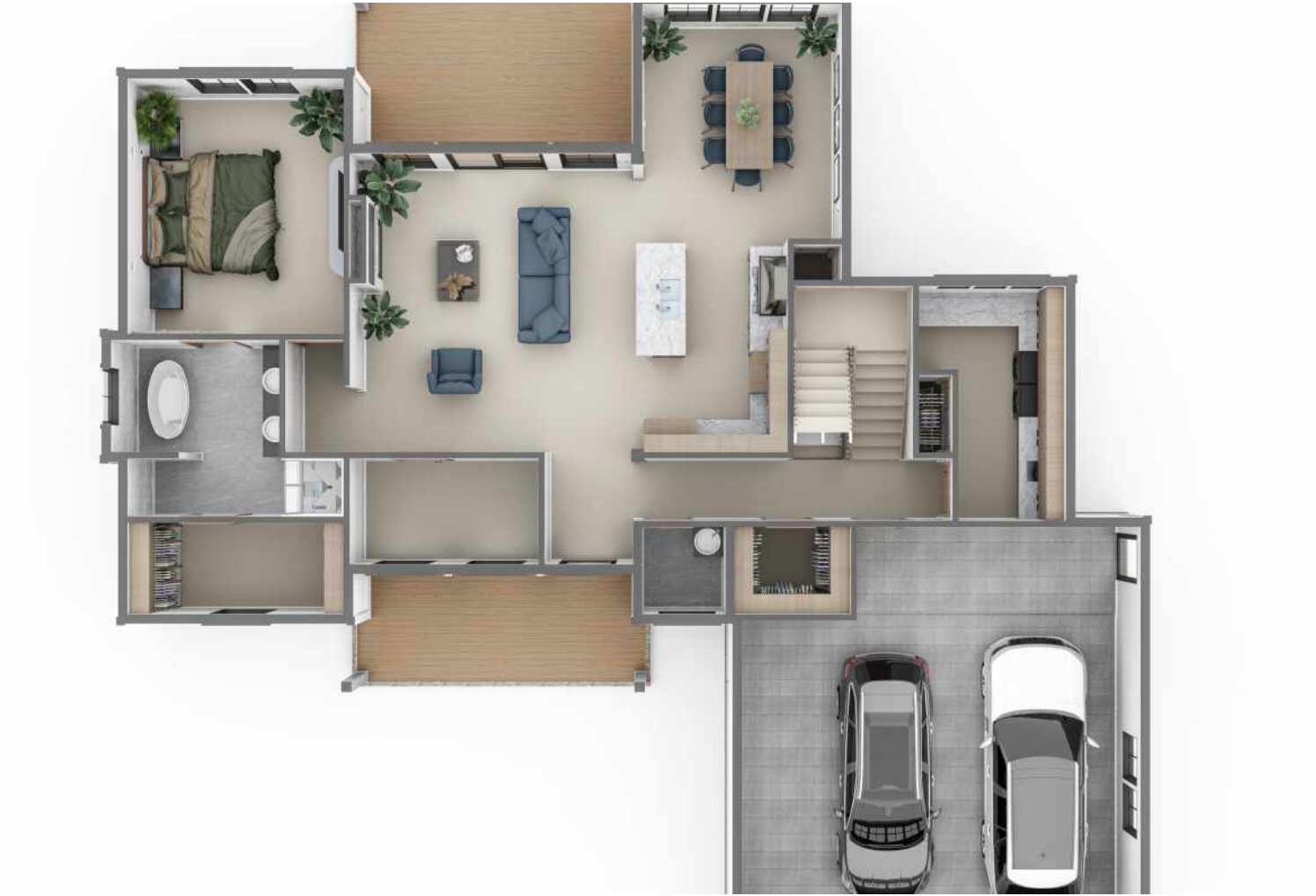
FIRST FLOOR | VIEW 1