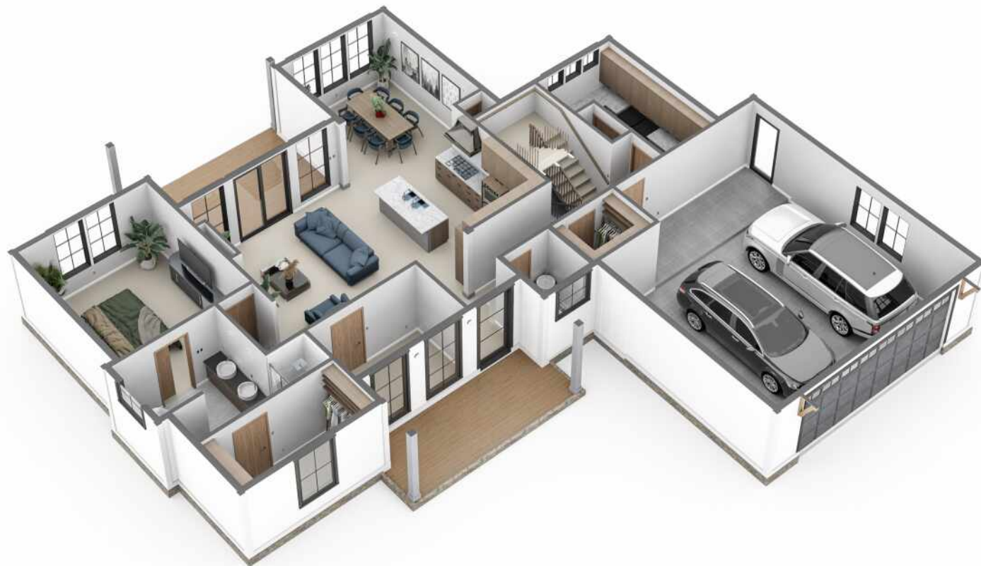
FIRST FLOOR | VIEW 1