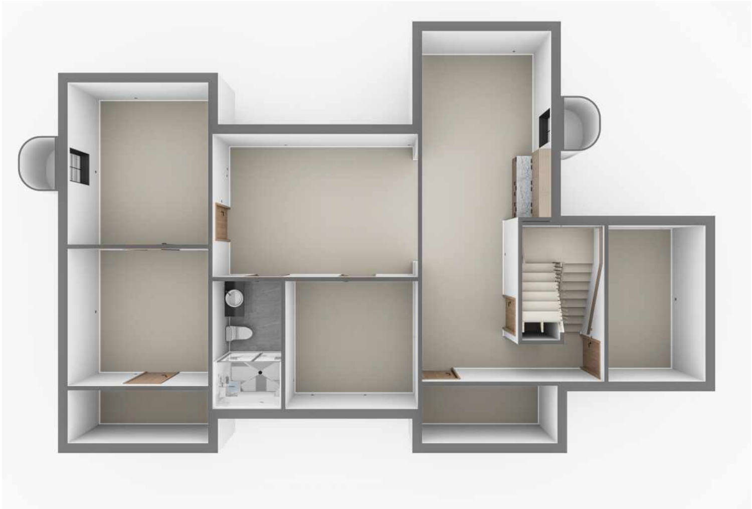
BASEMENT | VIEW 2